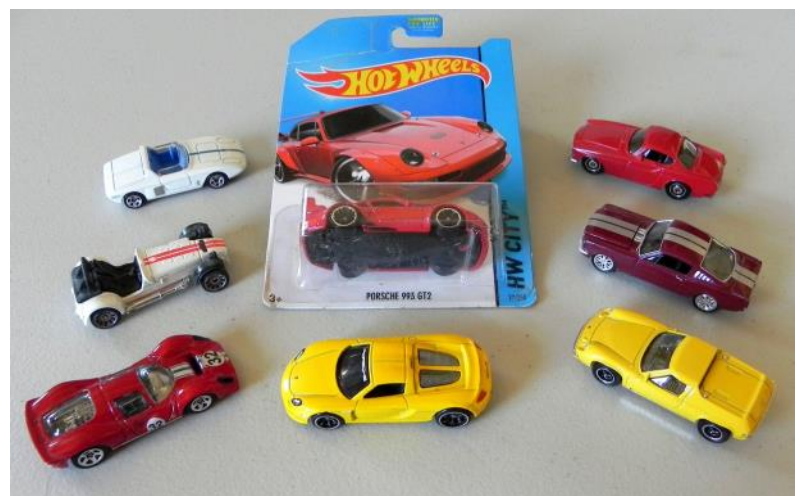
Some Matchbook and Hot Wheels cars are very nice, 1:64 Scale