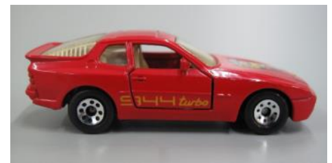
Some Matchbook cars look terrible like this 944 Turbo in 1:64 scale