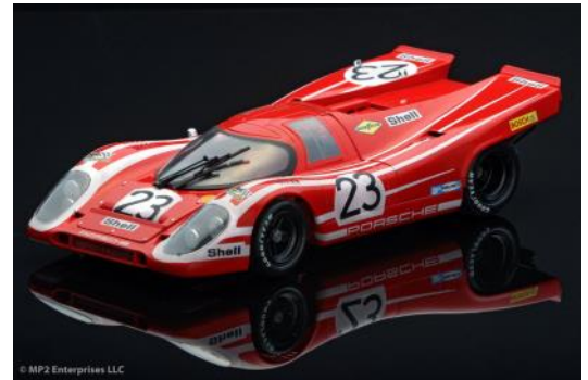
This 1:32 1970 Porsche 917K LeMans Winner is only $22