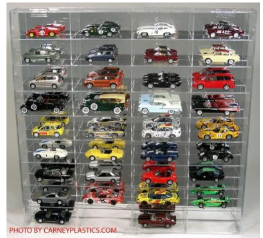
Display case from Carney Plastics for 1:43 scale

The next most affordable toy cars are usually the 1/32 cars found at truck stops and super markets. These range