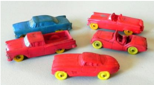
My old Auburn rubber cars from the 1950s