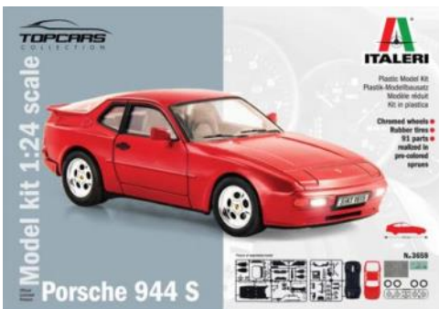
My Italeri Porsche 944S2 kit in 1:24 scale