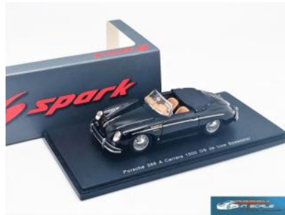
Some cars look just right like this 356 Speedster by Spark in 1:43 scale