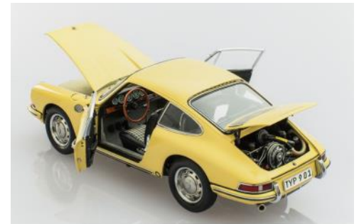
Amazing detail in this Porsche 911 in 1:18 scale by Racing Heroes