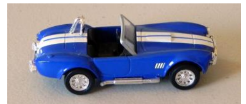
Some cars just look wrong like this inexpensive Cobra in 1:43 scale