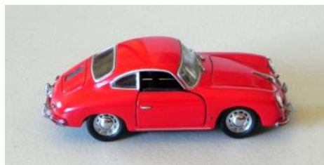
Opening doors look terrible on the smaller scales, 1:43 scale