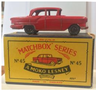
LESNEY Matchbox very rare 45a red Vauxhaul Victor