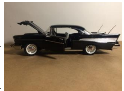
Danbury mint 1957 Chevy Bel Air 1:24 scale diecast