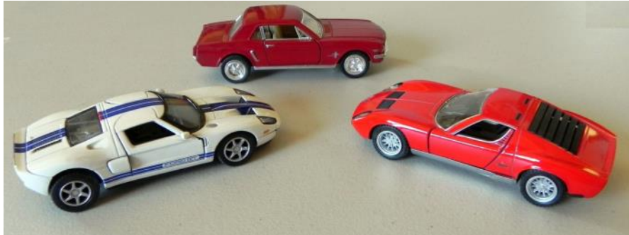
Very nice and less nice 1:32 scale cars are even found in supermarkets

shops and specialty online stores will carry fun, new cars. However you decide to approach collecting toy cars, begin by learning more about the products and toy collecting terminology. This is particularly important if you're collecting older models, since you'll have to assess each car's condition and details. Once you begin your collection, maintain proper care and storage of your cars. Many collectors like to display their cars, but don't forget to save the original packaging if you're treating a car as an investment piece."