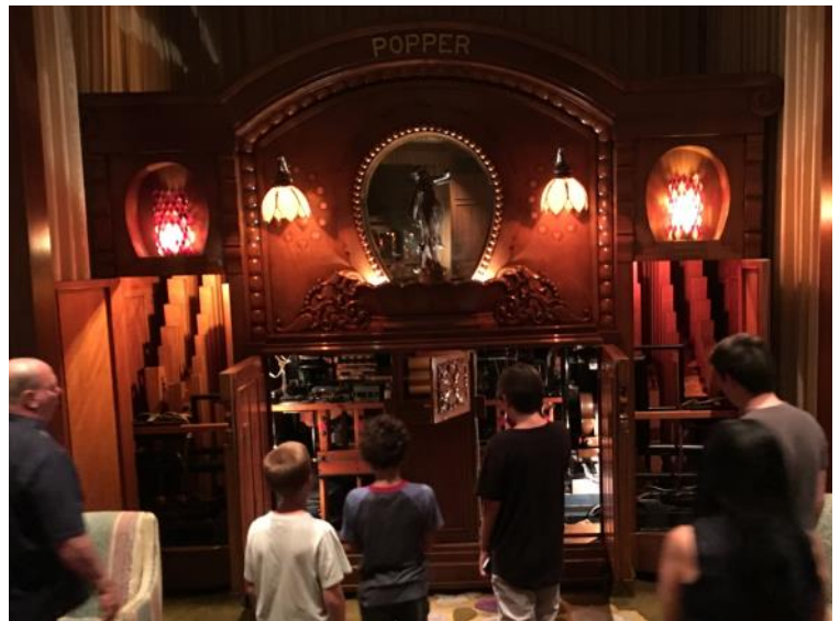
A crowd inspects one of the many Orchestrals found at the Nethercutt Collection.