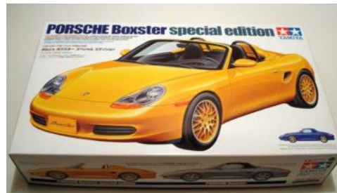
Tamiya Porsche Boxster Special Edition