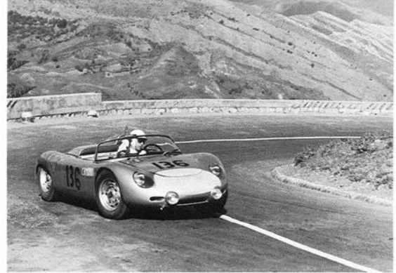
Stirling Moss at the Bivio Polizzi with the Camoradi USA RS61 Porsche.

6:30 Gates open 8:15 Tech Inspection closes 8:25 Mandatory Drivers meeting 8:45 Practice lap around the course behind a pace car 9:00 Course is Hot- first driver out!