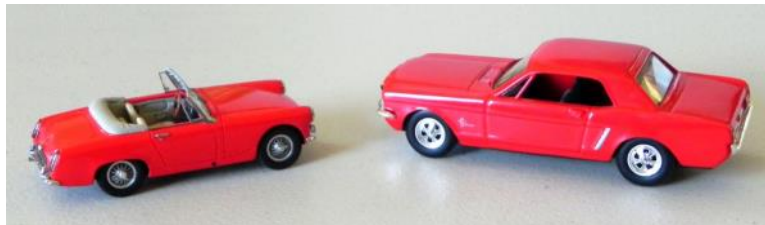
Correct scale relationship, 1:43 scale