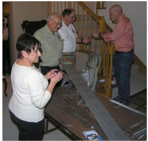
Cal Inland Members Enjoying Hot Wheels Race at a Holiday Dinner