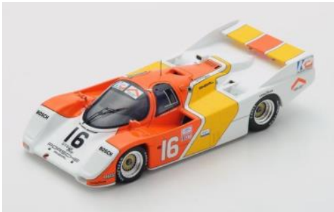
Scrumptious Porsche 917 by Spark, you get what you pay for, 1:43 scale