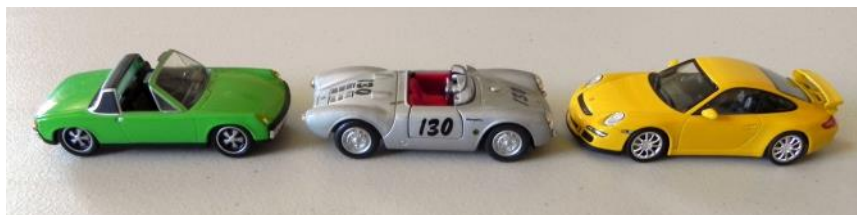
A Porsche 550s that is as big as a 911 is an example of poor scale relationship