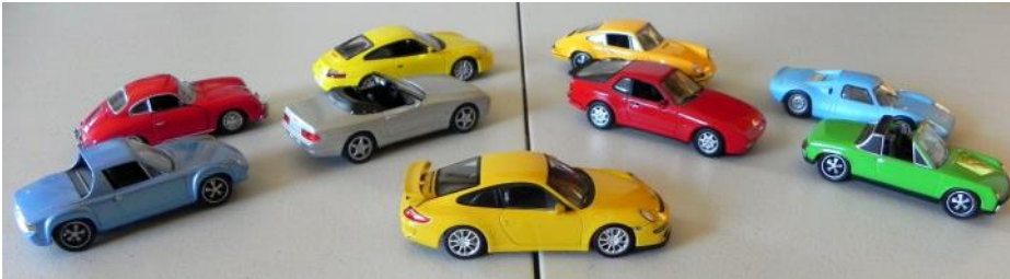
A smattering of Porsches in 1:43 scale