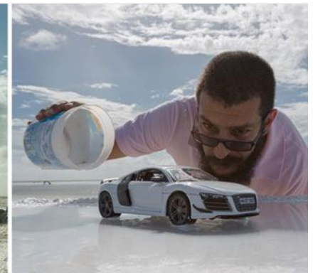
Audi ad photo create by using a model car