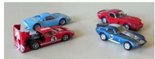
LeMans Cars from the Past, 1:43 Scale