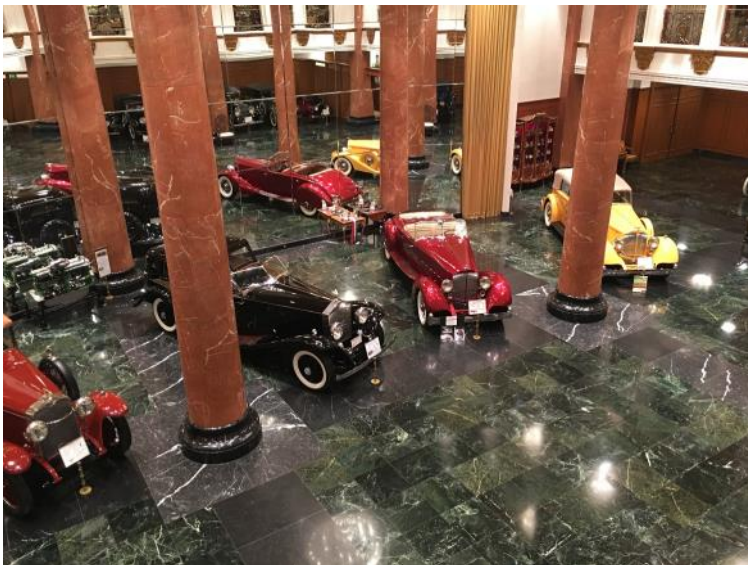
The most famous cars of the Nethercutt Collection are housed in an area designed to look like a dealership from back in the day.

If you have any ideas or suggestions for events, do not hesitate to contact any of the board/committee members!!!