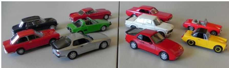
My past enthusiast's cars in 1:43 scale